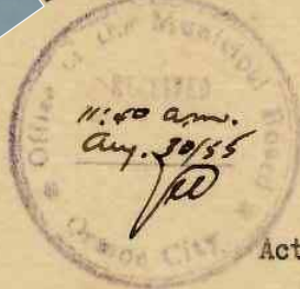
RAFAEL M. MEJIA Actg. Vice Mayor & Actg. City Mayor